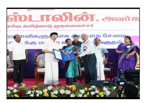
State Government Award for Barrier Free Environment