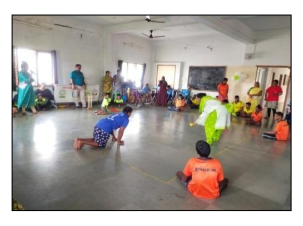
Indoor Cricket Tournament for children with Cerebral Palsy

Inter-Centre Cricket Tournament was held at the Auditorium of the Spastics Society in which Trichy Super Kings was the winner of the tournament on 10 October 2022.