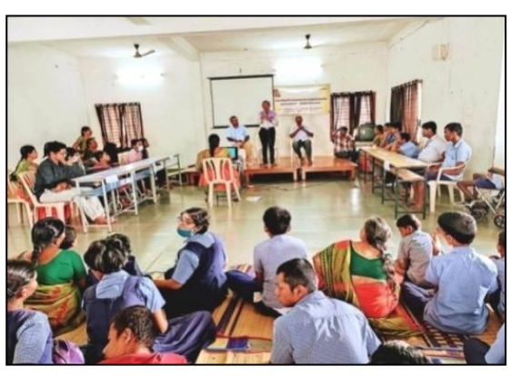
Inter School Quiz Competition

> out a winner. This was held on 11 October 2022.