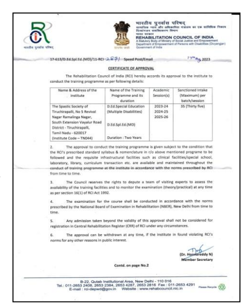
Copy of the approval letter from RCI, New Delhi

As part of the Alumni Meet, seminar was conducted through Google meet on 10<sup>th</sup> June 2022 in which 82 Alumnus participated. The topics are as follows.