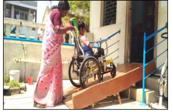
Ramp at the entrance

in Hotel Management & Catering Technology at Carnival Catering Institute, Thuraiyur.