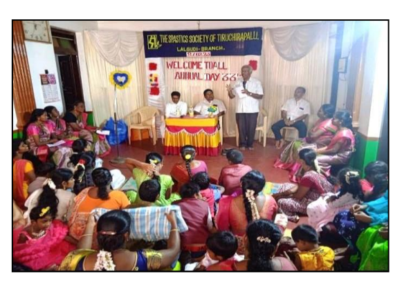
Annual Day Programme at Lalgudi