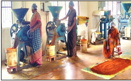
SST Masala Unit at Crawford

SST Masala Unit: The masala products such as chilli powder, coriander powder, sambar powder, etc. have been sold for a total supply of 19,373 kg at a total cost of Rs.38,70,816/-. We supply masala products to -