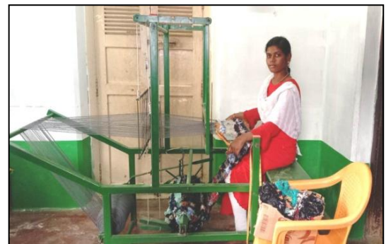
Doormat Unit at Musiri Centre

Sale in Delightful Shoppy, Coffee Shop & Handwork Articles fetched us an amount of Rs. 42,013/-