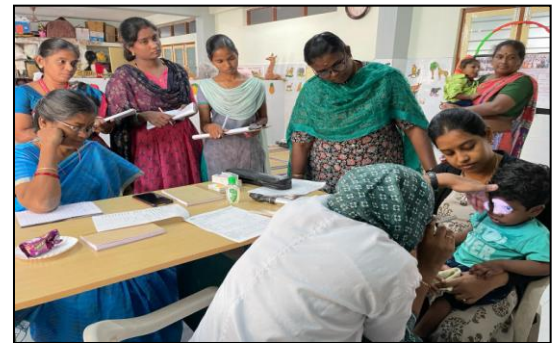
Screening by the Team from Joseph Eye Hospital, Trichy