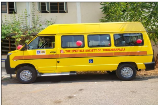
21 - Seater School Van donated by LIC