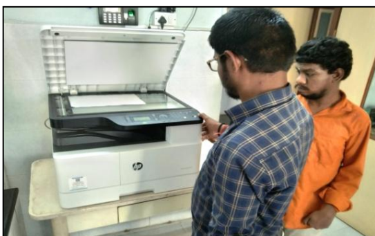
Training in taking photocopy

➤ New trade added in our Vocational Training Unit are -