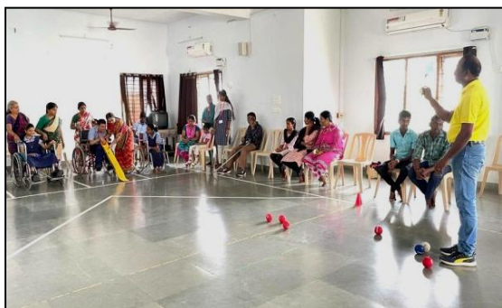
Paralympic Sport, Boccia Game being played by CP children in the Auditorium