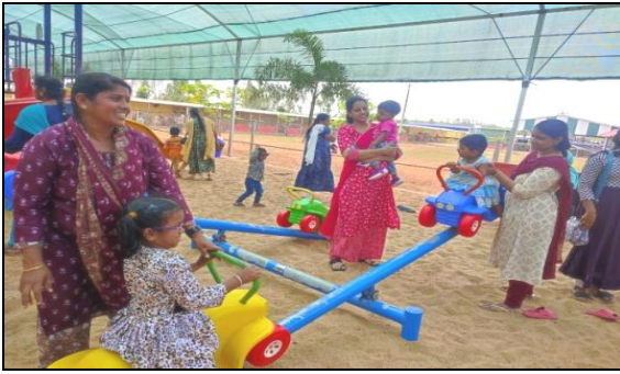
Fun time at Ajman Farm

The children, parents and staff of Early Intervention Centre were taken for a one-day picnic to Ajman Farm near Thogaimalai. It was an exciting day for all of them to see camels, ostrich, giraffe in a mini zoo setup.