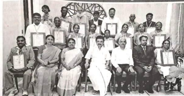
மாற்றுத்திறனாளிகளுக்கு சிறந்த சேவை செய்தவர்களுக்கு விருதுகளை சென்னை தலைமைச் செயலகத்தில் திங்கள் கிழமை வழங்கி கொண்டிருந்த முதல்வர் மு.க.ஸ்டாலின். உடன் அமைச்சர் கீதா ஜீவன், தலைமைச் செயலர் சிவ தாஸ் மீனா உள்ளிட்டோர்.

யோருக்கும் விருதுகள் வழங்கப்பட்டன. மாற்றுத் திறனாளிகளை அதிகளவில் பணியமரித்தும் நிறுவனமாக காஞ்சிபுரம் பச்சையப்பாஸ் சில்சஸ் நிறுவனத்துக்கும், சிறந்த ஆரம்பநிலை பல்நிச்சி மைய