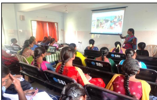
Training on Community Based Rehabilitation Programme