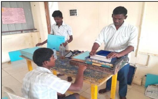
Screen Printing at File Making Unit

File Making Unit: We were able to produce & supply a total of 10,550 files at a total cost of Rs. 1,34,450/-. Our regular customers are –