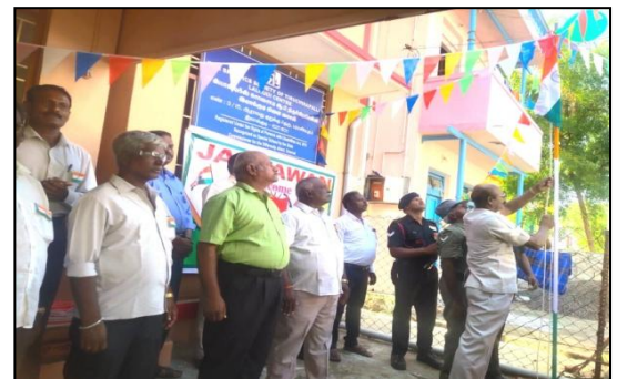
Flag hoisting by the President of Jai Jawan Sangam on Republic Day