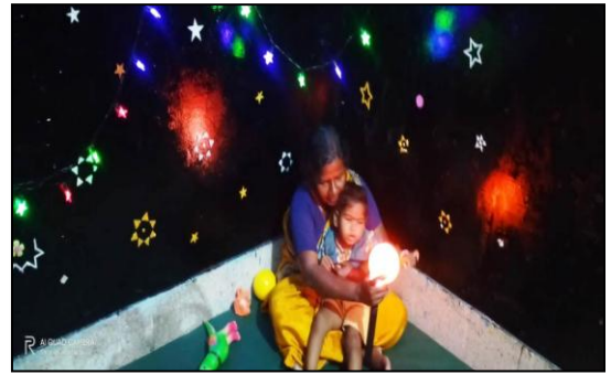
Glowing colourful lights in the dark room stimulation