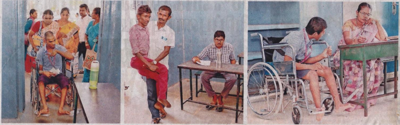
▶ திருச்சி மரக்கடை பகுதியில் உள்ள சையது முர்துஷா பள்ளியில் 10ம் வகுப்பு தேர்வெழுத தனது மாற்றுத்திறன் குழந்தைகளை ஆர்வமாக அழைத்து வந்த பெற்றோர்கள். கடைசிபடம்: மாற்றுத்திறன் மாணவருக்கு உதவியாக தேர்வெழுதும் ஆசிரியை.